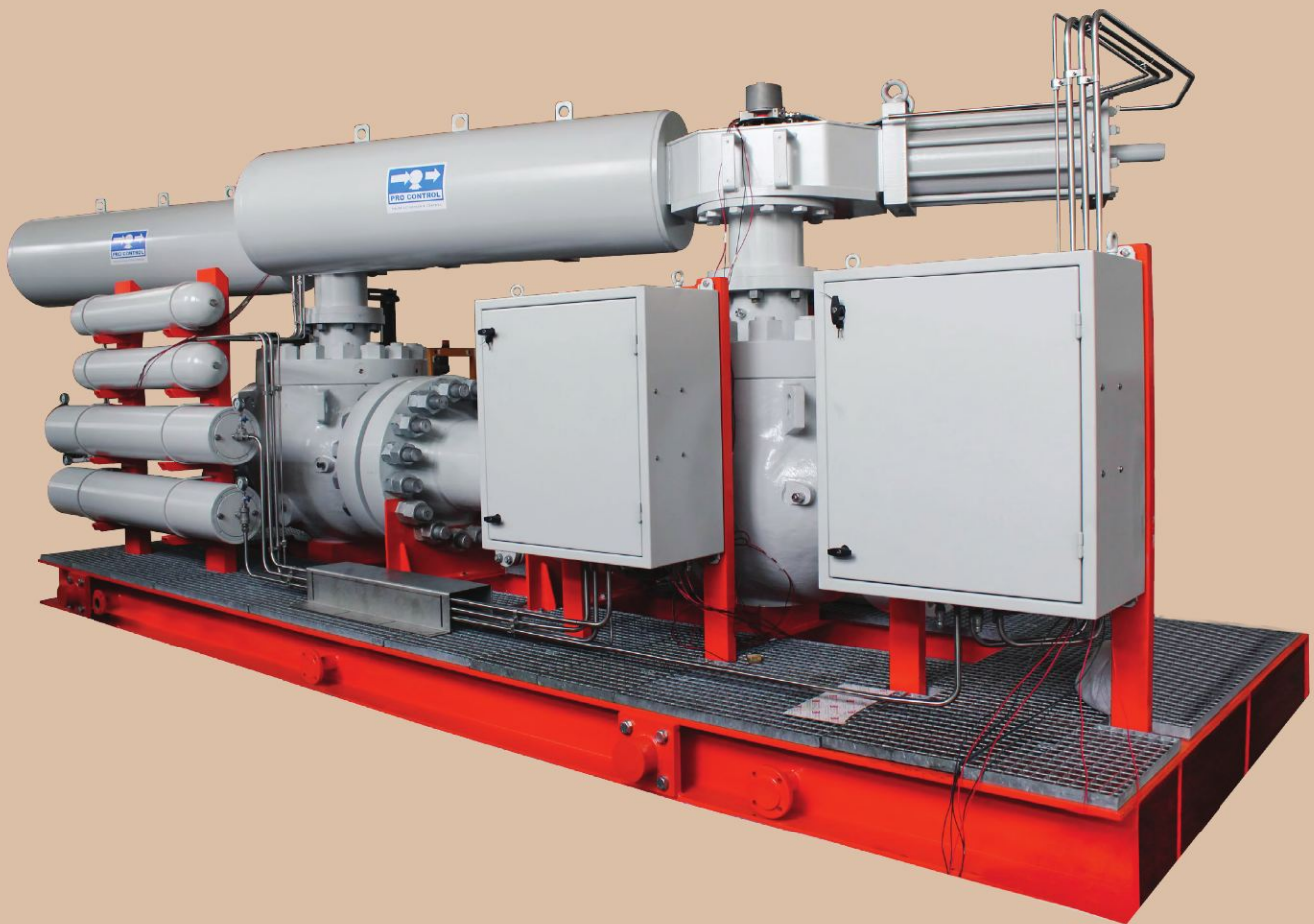
High Integrity Pressure Protection system (HIPPS)

With a track record of supply to major projects in Oil, Gas, Petrochemical, Power, Metal and Mine Industries, we offer original equipment from all major and reputable European and Japanese manufacturers, complete with all relevant certificates and guarantees.