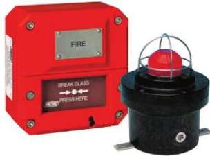
Fire & Gas Equipment

We supply all types of Pressure, Flow, Temperature, Level Gauges, and Transmitters, as well as Tank Gauging systems from reputable world manufacturers.