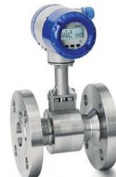
Vortex type Flow Transmitter (long-term stability and high accuracy)