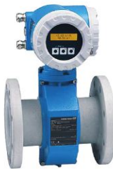
Magnetic Type Flow Transmitter (Non-contact type for conductive Fluids)