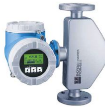
Coriolis Type Flow Transmitter (Low Flow measurement)