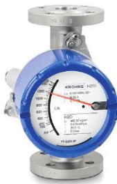
Rotameter Type Flow Indicator (Float, and tube type Flow measurement)