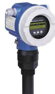
Ultrasonic type Level Transmitter (non-contact Level Measurement)