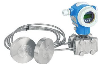
Differential Pressure Transmitter (Differential Pressure, Flow, and Hydrostatic Level Measurement)