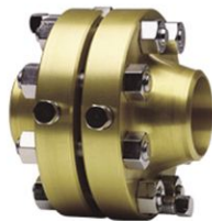
Orifice Flange Element (Flow Element with differential pressure)