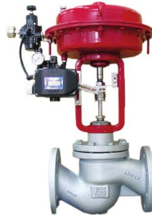
Control and On-Off valves (Ball, Globe Gate and Butterfly) ESD valves