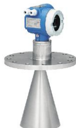
Radar type Level Transmitter (non-contact Level Measurement used for high accuracy)