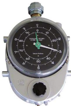
Level Gauge (side mounted Indicator for storage tanks)